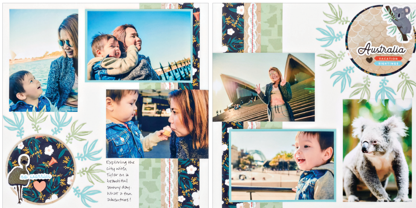
Theme Pack Pictured: Aussie Adventure