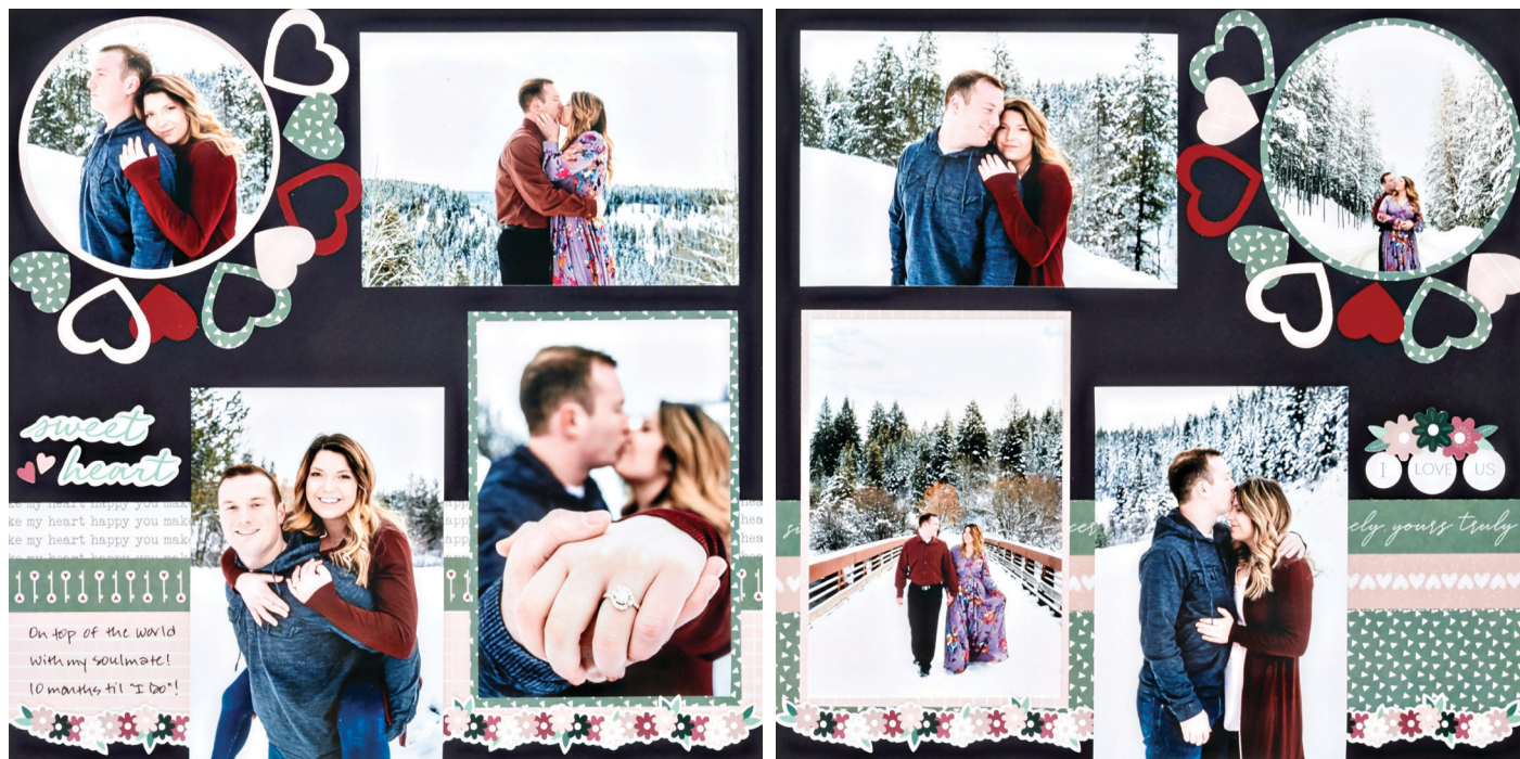
Theme Pack Pictured: Sweetheart